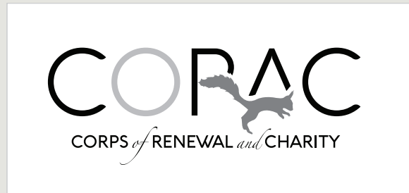
Standard black/white logo configuration.