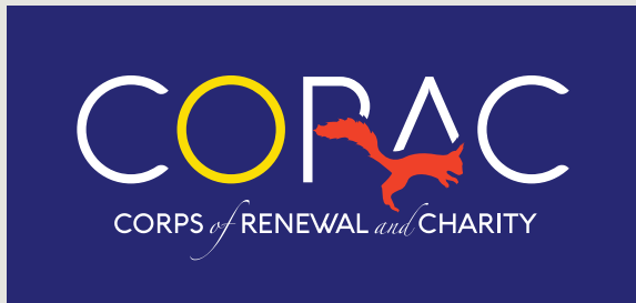
Standard full color configuration on any dark background.