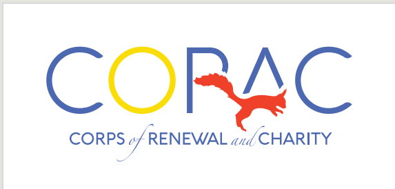
Standard full color logo configuration

Logo Variations: Please note that the preferred logo variation contains classic Royal Blue. If it appears reversed on a blue field, it should be a Navy Blue field so the warm red does not create a visual conflict.