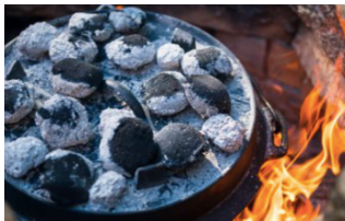
Cooking, Canning, Dehydrating & Storage Resources

Another interesting tidbit from the Sustainable Living section of the website: https://corac.co/2022/02/16/cooking-canning-dehydrating-storage-resources/