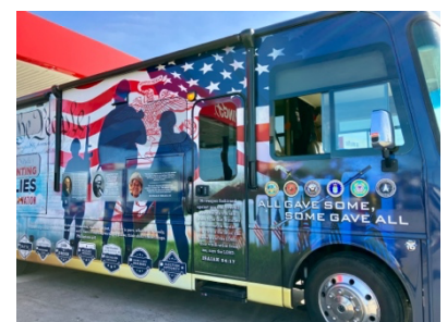
Convoy lead vehicle

I made a trip down to Beaumont to see for myself what the Convoy is up to. They had just crossed the Louisiana border into Texas, and were making a refueling stop at the Flying J in Orange. I expected maybe 25 vehicles, and there were over 100, so it was bigger than I thought, but definitely not "massive," which may be a blessing as the feds will be less likely to invest their time. More vehicles will join as the Convoy crosses the state, especially if it is clear that peace and calm heads prevail. I salute those who have joined the little Convoy, clearly having a great time, honking and flag-waving and making friends, despite a government that would prefer we cower at home, have zero fun, and be afraid of each other