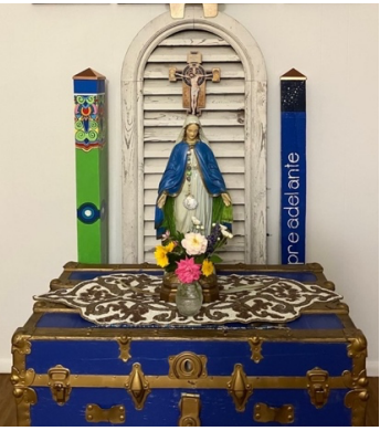
Sheryl – Best use of garden posts