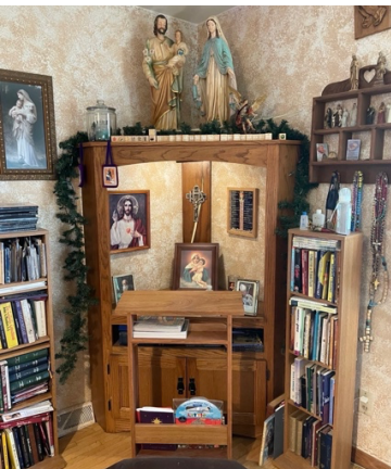
Laura - Best use of corner space