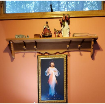
Susan- Best integration of the outdoors