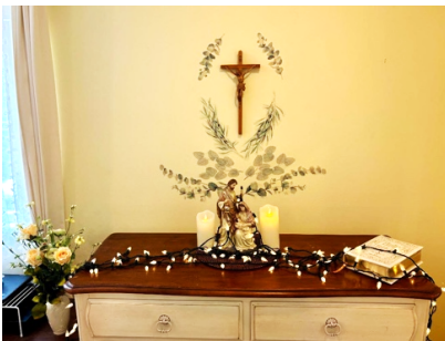
Marie - Best use of wall decals