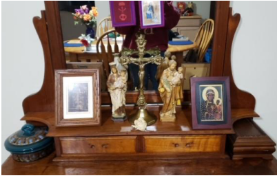
Mick – Best use of vintage furniture

Some of the early entries to the Home Altars contest: